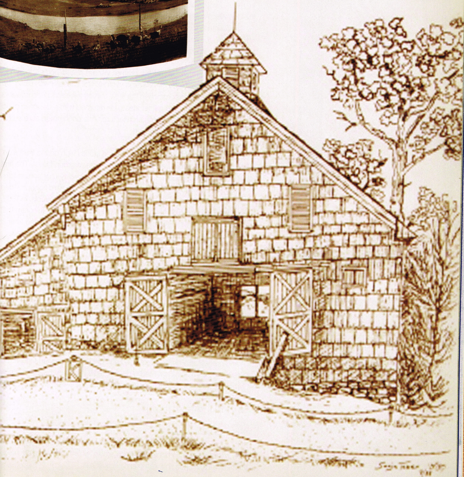
The Medlin Barn as it might have looked upon construction